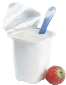
Yogurt (small pot)