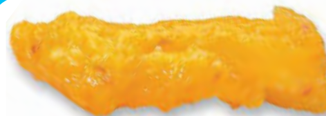
5lbs of fat