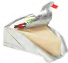
Low fat soft cheese