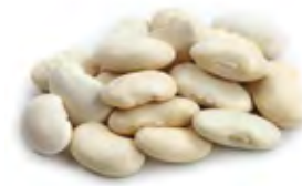
Butter beans (x1 palm of the hand)