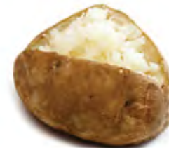
Jacket potato (fist size) = 2 portions