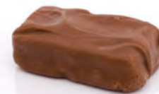
Fun size chocolate bar