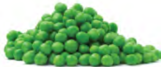
Peas (1/3 of a plate) = 1 portion