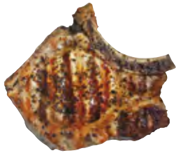
Pork/lamb chop 2-3oz / 50-70g (x1 palm of the hand)