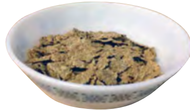
Bran flakes (4-5 tablespoons) = 2 portions