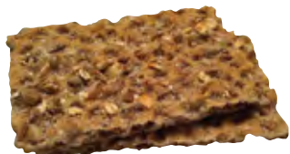
2 crisp breads = 1 portion