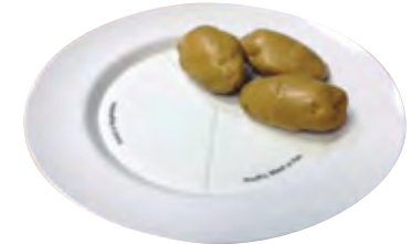
Potatoes (egg size) = 2 portions