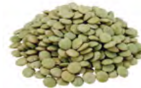
Green lentils (x1 palm of the hand)