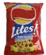
Crisps (25-30g bag)