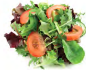
Mixed salad (1/3 of a plate) = 1 portion