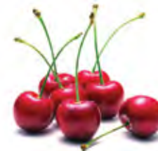
Cherries (handful) = 1 portion