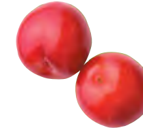
Plums (x2 small) = 1 portion