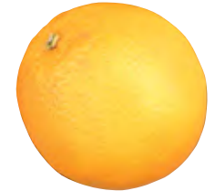
Orange (handful size) = 1 portion