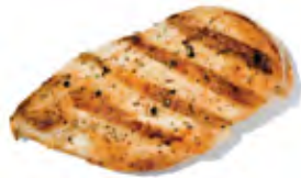
Chicken 2-3oz / 50-70g (x1 palm of the hand)