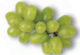
Grapes (handful) = 1 portion