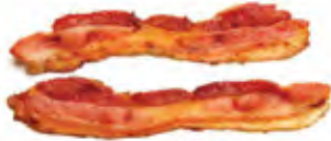
Bacon (x2 small rashers)