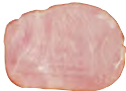
Ham (x1 large slice)