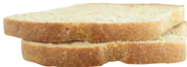
Bread (medium) 1 slice = 1 portion 2 slices = 2 portions