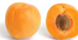
Apricots (x2 small) = 1 portion