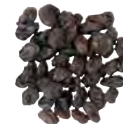
Raisins (1/2 handful) = 1 portion