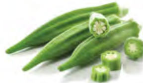
Okra (1/3 of a plate) = 1 portion