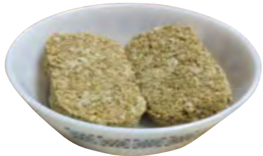
Wheat biscuits (x2) = 2 portions