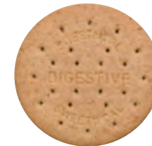
Plain digestive biscuit