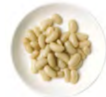
Cannellini beans (x1 palm of the hand)