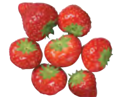
Strawberries (handful) = 1 portion