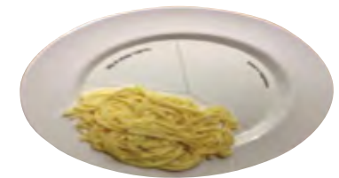
Cooked spaghetti (4-5 tablespoons) = 2 portions