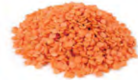
Red lentils (x1 palm of the hand)