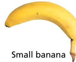
Small banana = 1 portion