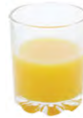
Fresh orange (150mls) = 1 portion

2-3 portions per day (each picture = 1 portion)