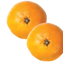
Satsumas (x2 small) = 1 portion