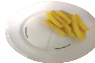
Chips 4-5 = 1 portion 8-10 = 2 portions