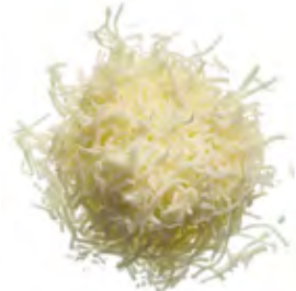
Grated cheese (20g)