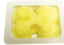
Low fat spread (5g / 1 teaspoon)

2-3 portions per day (each picture = 1 portion)