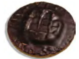
Orange sponge biscuit