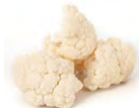
Cauliflower (1/3 of a plate) = 1 portion