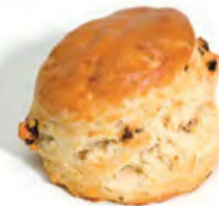
Scone (x 1/2)