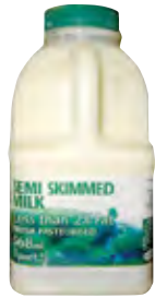
Milk (1/3 of a pint)

2-3 portions per day (each picture = 1 portion)