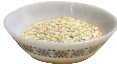
Porridge (4-5 tablespoons) = 2 portions