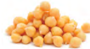
Chickpeas (x1 palm of the hand)