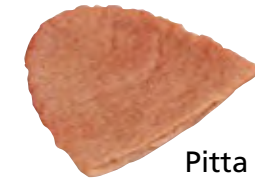
Pitta bread (x 1/2) = 1 portion