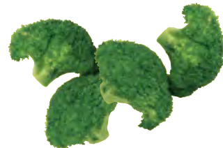
Broccoli (1/3 of a plate) = 1 portion