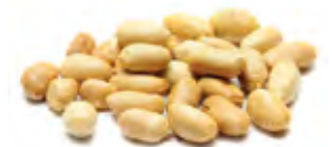
Peanuts (1/2 handful)