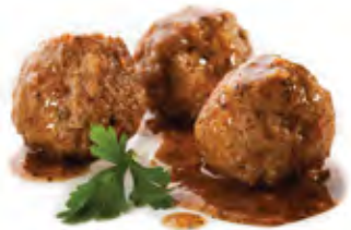
Meatballs 2-3oz / 50-70g (x1 palm of the hand)