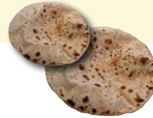
Chapati small = 1 portion large = 2 portions