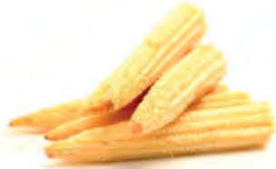
Mini sweetcorn (1/3 of a plate) = 1 portion