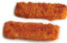
Fish fingers (x2)