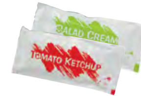
Tomato sauce/salad cream (5g / 1 teaspoon)