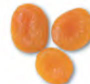
Dried apricots (x3) = 1 portion