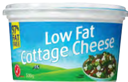
Cottage cheese (small pot)