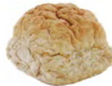
Bread roll (x1) = 1 portion