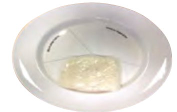
Cooked rice (4-5 tablespoons) = 2 portions