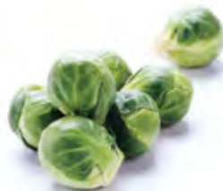
Sprouts (1/3 of a plate) = 1 portion