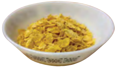
Corn flakes (4-5 tablespoons) = 2 portions