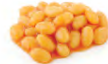
Baked beans (x1 palm of the hand)