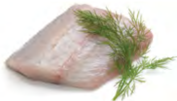
White fish 2-3oz / 50-70g (x1 palm of the hand)