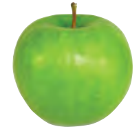
Apple (handful size) = 1 portion