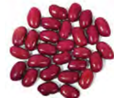
Red kidney beans (x1 palm of the hand)