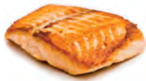
Salmon steak 2-3oz / 50-70g (x1 palm of the hand)