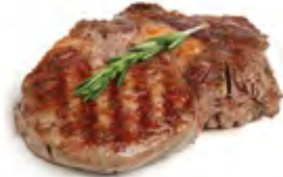
Steak 2-3oz / 50-70g (x1 palm of the hand)